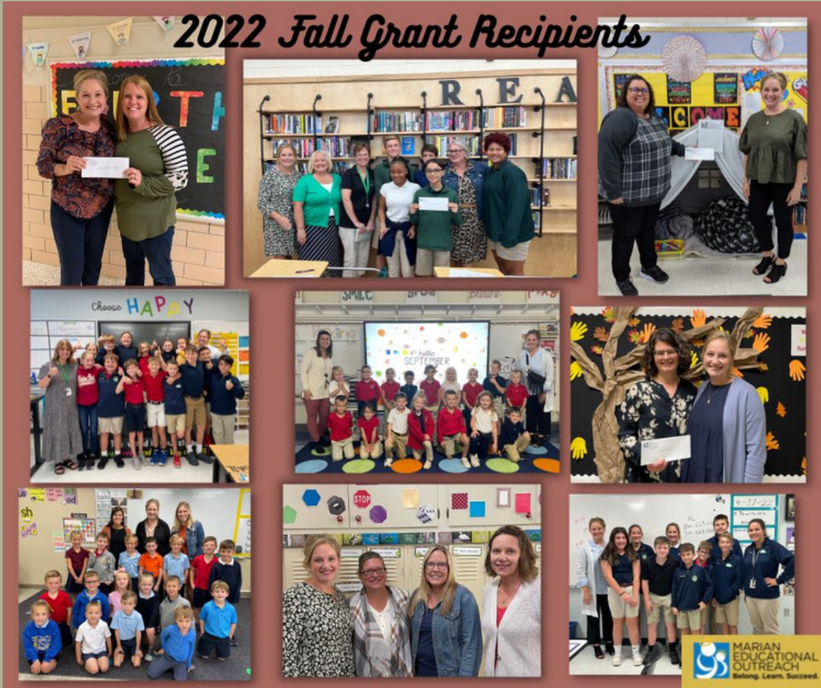
Pictured above are grant recipients from September 2022. See more info inside!

The MEO Star Newsletter for Marian Educational Outreach