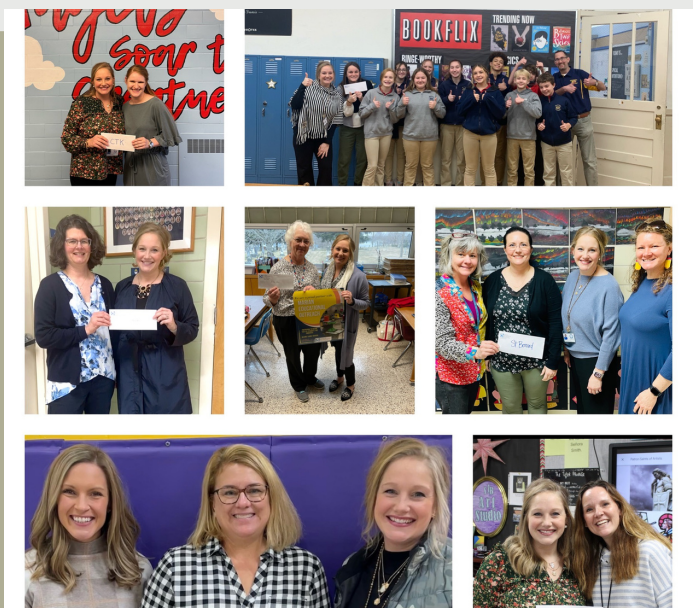
Grant Recipients from January 2022 pictured above. Westside Catholic, St. Matthews, St. Joe (Co), Holy Trinity, St. John the Baptist, St. Bernard, and Christ the King

To support classroom grant projects, visit our website and donate online at www.meoforkids.org/give or mail checks to 520 S Bennighof Ave. Evansville IN 47714.